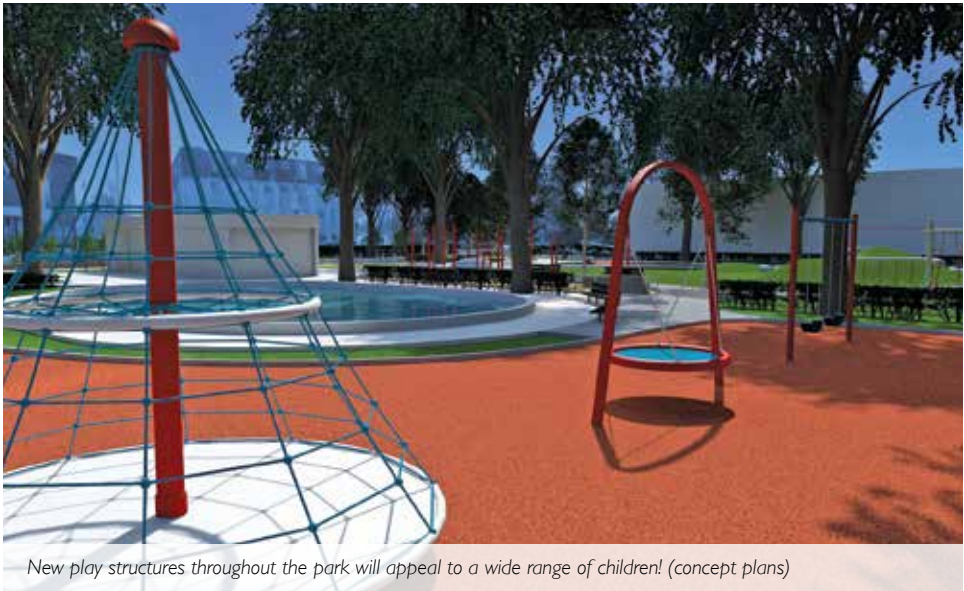
New play structures throughout the park will appeal to a wide range of children! (concept plans)