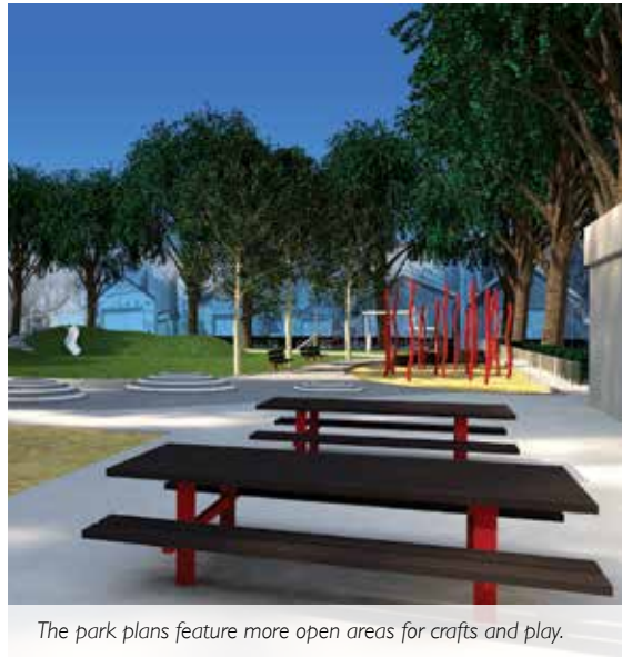
The park plans feature more open areas for crafts and play.