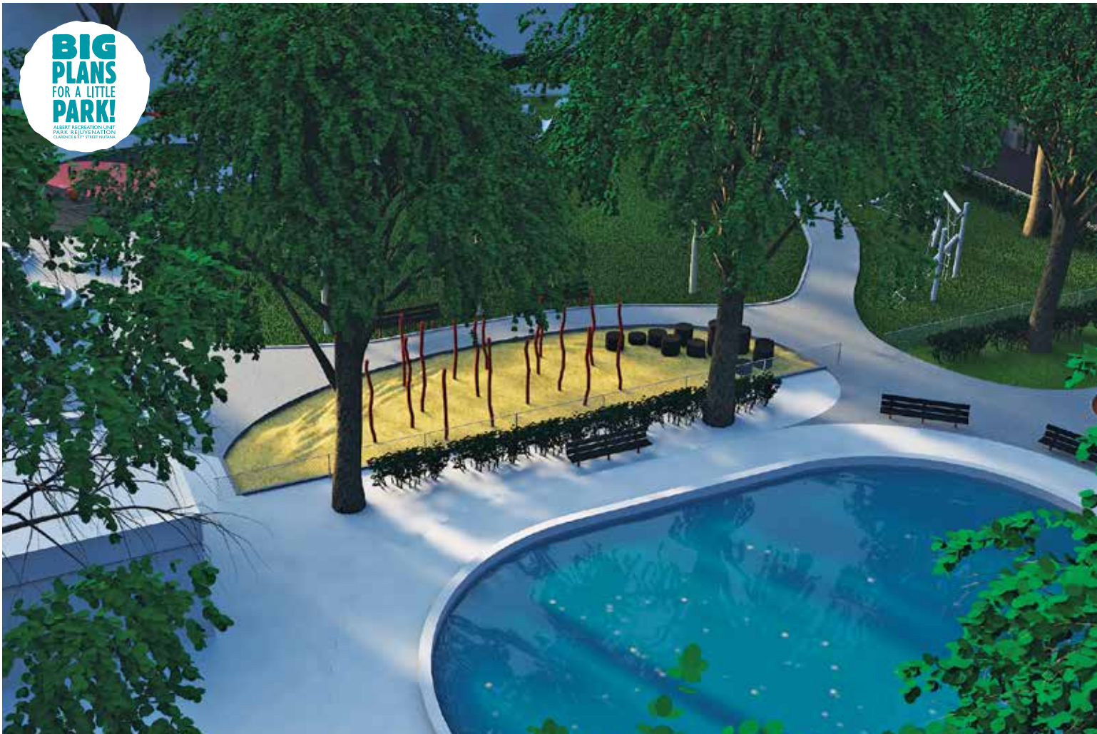
The centre piece of the rejuvenated park will be the red 'l'icone sticks' play structure – a place for imaginative play, tag, climbing or strength training. Short height stepping logs will be nearby, serving as balance and agility structures for younger children and functioning as impromptu seating arrangements.