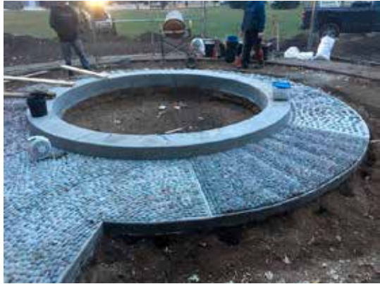
Photos of Raoul Wallenberg park under construction in October 2018. Watch for more details on our website about a park celebration and BBQ to raise additional funds for this beautiful project.

our community for high-rise development.