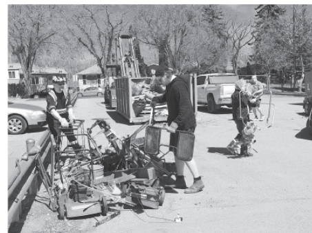
Community Clean Up.

Once more we are going to run our community clean-up. The date is tentatively set for May 2nd. This year we will be based on Copeland Crescent in Grosvenor. Our hours will be 9-12 noon. Bring your junk, your neighbors' junk, the junk from your back alley. Even better, bring a truck and get a clean up route. I am always amazed by the