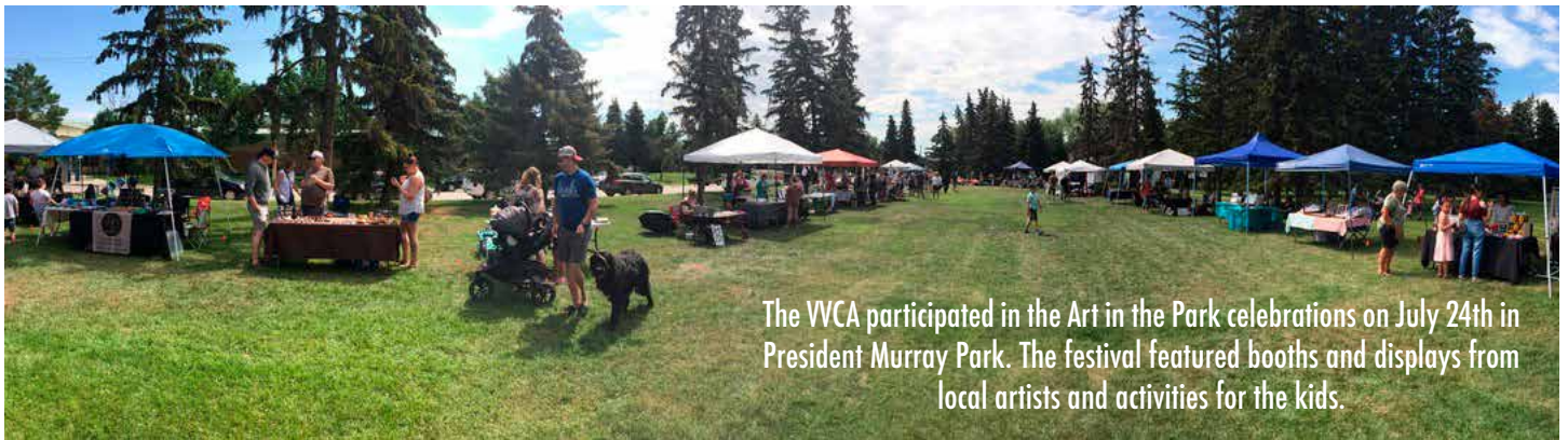
The WCA participated in the Art in the Park celebrations on July 24th in President Murray Park. The festival featured booths and displays from local artists and activities for the kids.